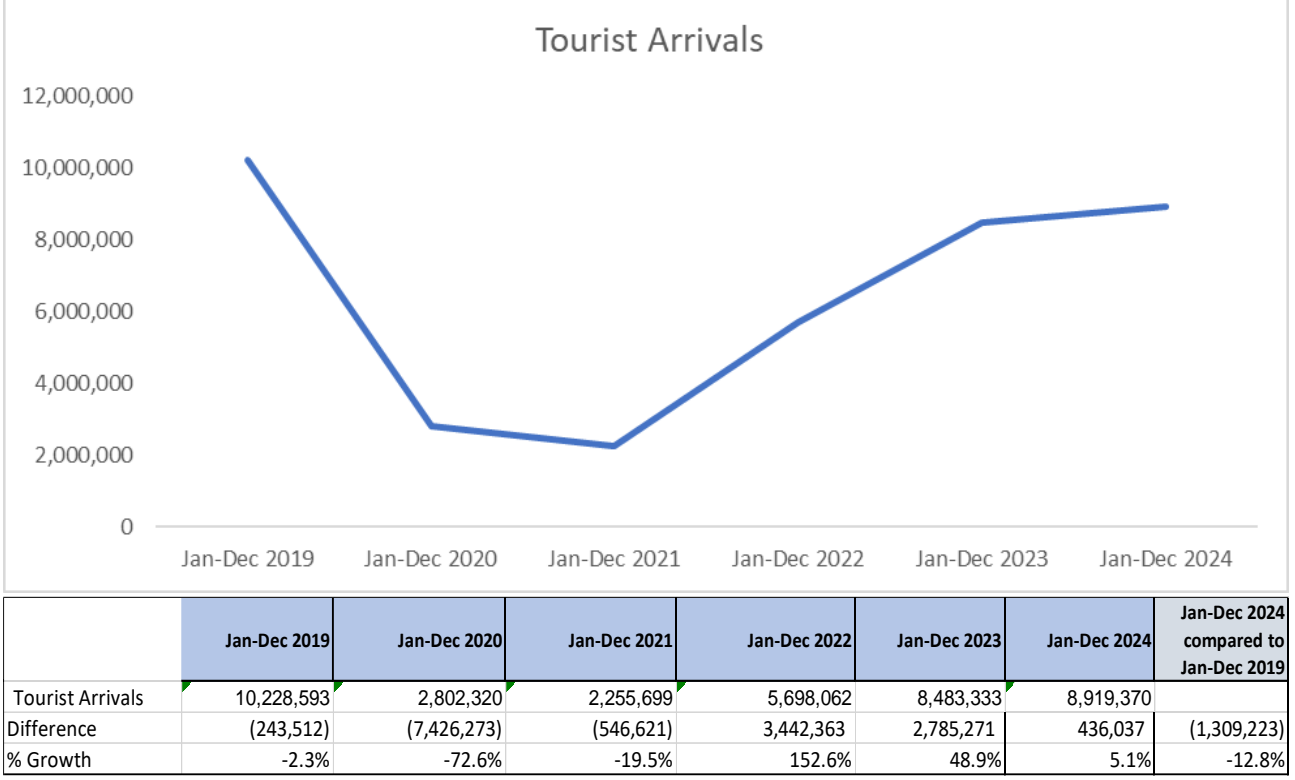
Figure 2: Total Tourist Arrivals January-December 2019 to January-December 2024